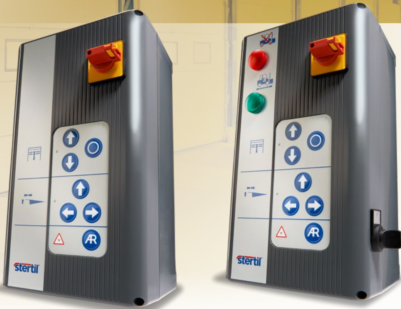
Stertil Multi Control (SMC)

Door operation: (SCD) This takes over the control of the up, down and stop functions for the door. The door control box continues to be used.