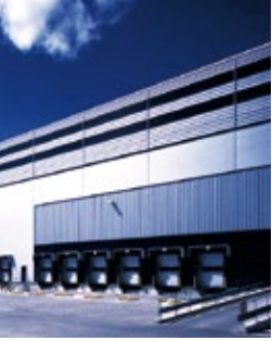
Stertil Basic Control (SBC)