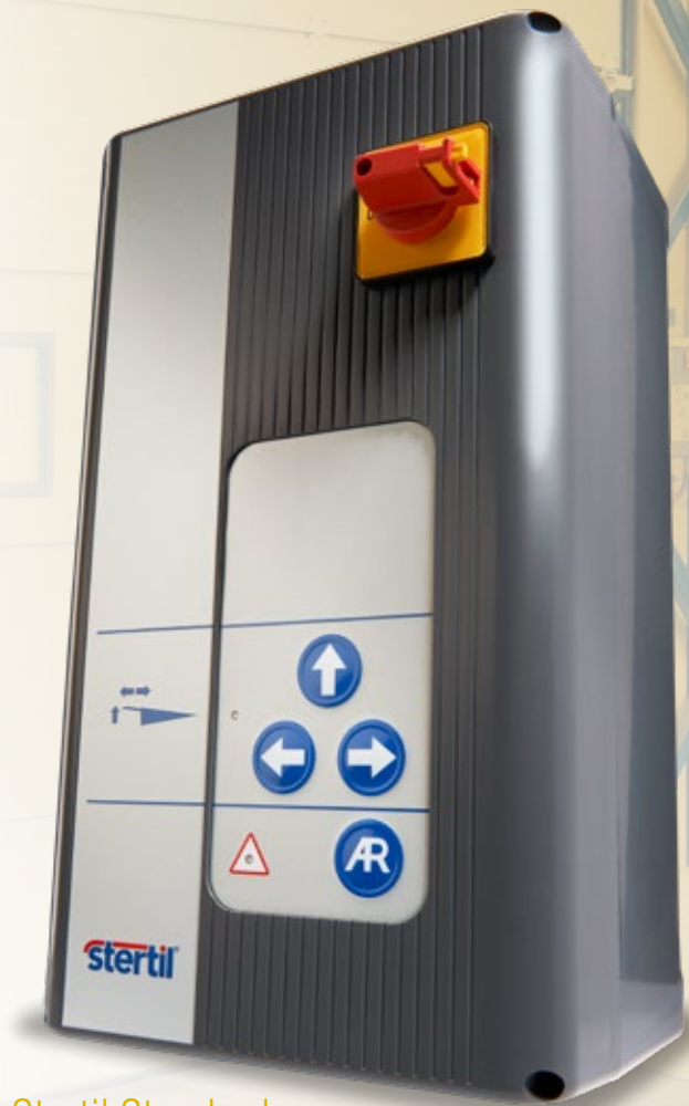
Stertil Standard Control (SSC)